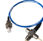
RGB White Pigtail Laser (Triplex)